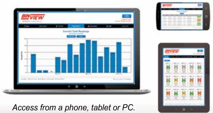
Access from a phone, tablet or PC.