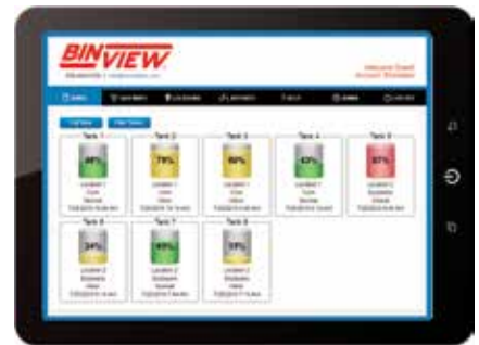
Tank view on a tablet