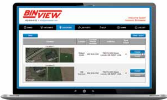
Location view on a PC