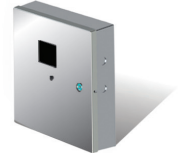
NEMA 1 enclosure: 11.375" w x 11.25" h x 3.5" d Use indoors, wall mounting Weight: 3.6 lbs