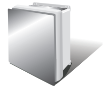
Outdoor NEMA 4X enclosure: 13.25" w x 13.75" h x 6.25" d With sun shield Weight: 7.6 lbs