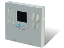
FlatPak NEMA 1 enclosure: 10.5" w x 7.75" h x 1.5" d Use inside MCC cabinet Weight: 1.8 lbs 5 Ah battery weighs additional 3.6 lbs