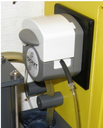
Quick Clamp Pump Head With Variable Speed Drive