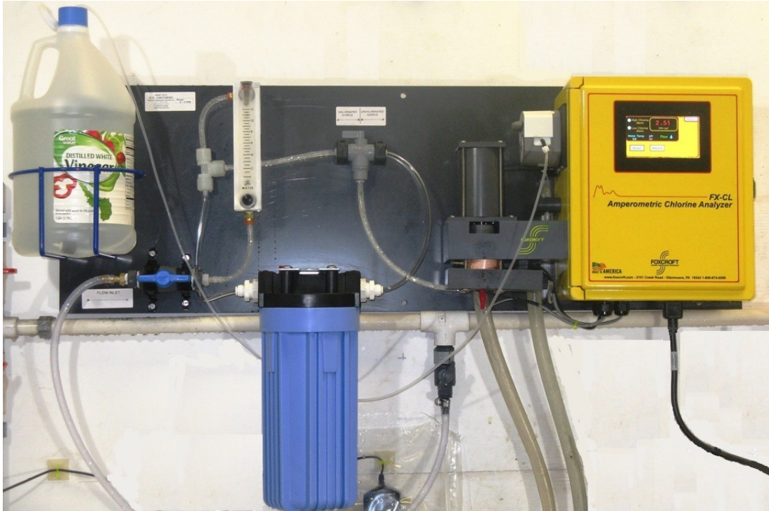
Optional Panel Mounting With Carbon Filter