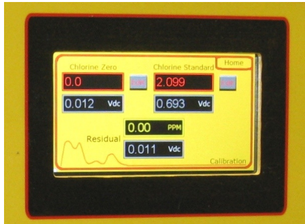
View Last Calibration Values & Live Readings During Calibration